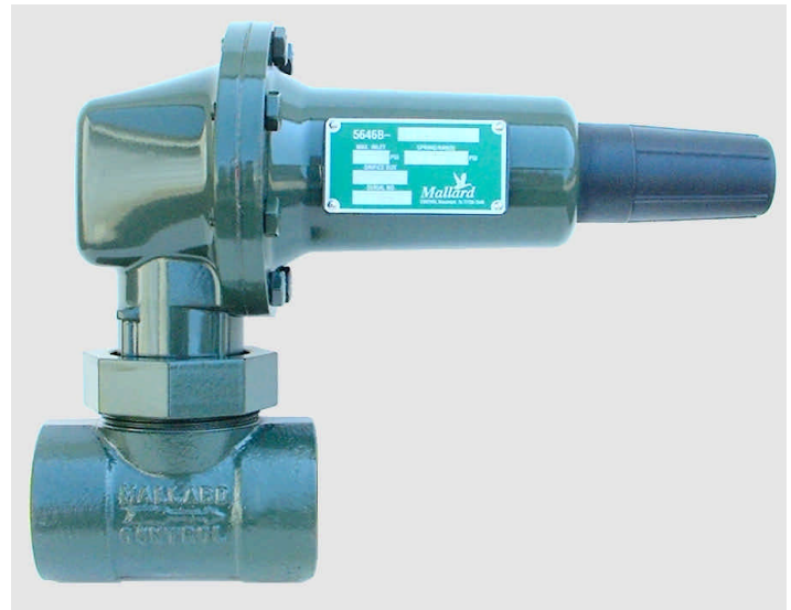
Figure 1. Model 5646 Pressure Regulator